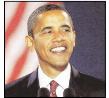
Barack Obama 44th President-Elect of United States of America

The Student Empowerment Seminar has previously been an event for high school students, however, in this year of change, elementary, middle and high school students from the Dallas Independent School District and the Fort Worth schools attended.